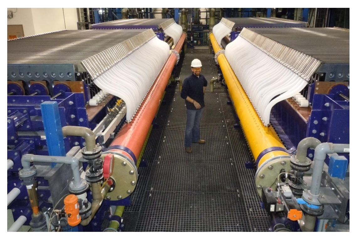
Figure 2: Two electrolysers in an operational environment

On an owned and operated basis, utilising low-cost power supply, OD6 has an aspirational target to achieve an operational reagent consumption cost that would be equivalent to about A$5-6/t of processed clay ore, assuming sunk capital costs.